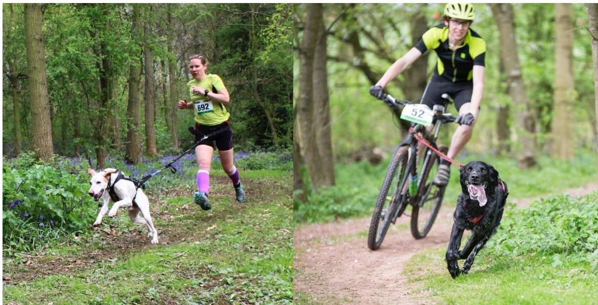
Figure 1: One dog canicross competitor on the left, one dog bikejor competitor on the right.

The sport canicross involves competitors completing a cross country style race either running, cycling or scootering, whilst harnessed to dogs (see figure 1). The dogs normally run ahead, taking up the slack in the bungee line and providing some assistance to the runner. Canicross is an effective means of exercising both runner and dog over relatively short ‘sprint’ distances of approximately 5km (although longer competitive distances are run). Now formally recognised by The Kennel Club, the sport has been run competitively in the UK since 2000, with increasing numbers of competitors taking part in races around the country (The Kennel Club, 2017). As race results are ultimately linked to both human and dog speed, the sport can promote increased physical activity, encouraging people to exercise with their dog to improve their race times, competitive performance, health and fitness in both species.